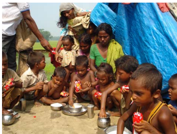
Children feast on milk & biscuits