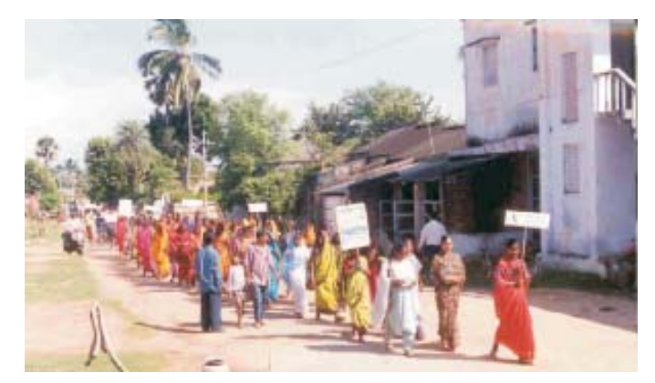
Awareness Campaigns by Volunteers