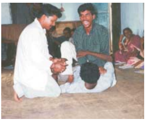
First Aid Training Session

would receive periodic training from the local medical (local health centre) personnel.