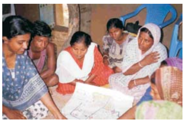
Women involved in Planning Process

g. Women Participation in Community Based Disaster Preparedness: Women, children and old age people are the most vulnerable groups in any emergency situation and need special attention and