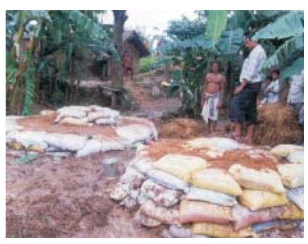
Community's Local Resources

Resource map: Resource mapping focuses on identifying locally available assets and resources that can be utilized for building the capacities of the community during and after disasters. Apart from infrastructure and funds, this could be individuals with specific skills, local institutions and people's knowledge as all these have the capacity to create awareness and bring about changes in the community. A resource map is therefore not limited to a map depicting the available resources but also