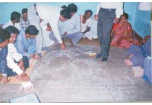
Villagers mapping their Risk & Vulnerability

Risk and vulnerability map: In the vulnerability map the community members have to identify the hazards that the village is prone to and the possible areas that would be affected. They also demarcate the low lying areas, areas near the water bodies such as the sea and river, direction of wind, etc. Through this mapping exercise the community members identify the location of groups at risk and the assets that require protection from various hazards.