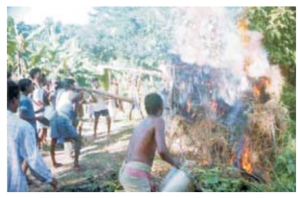
Fire Response Drill

9. Damage Assessment Team: With things getting better after the disaster, the damage assessment team carries out an assessment of the damaged houses, livelihood assets and crops etc. Usually a Govt. functionary from the state Revenue Department carries out such assessments after a particular period. During this exercise, the damage assessment team helps him/her in making a timely and useful assessment.