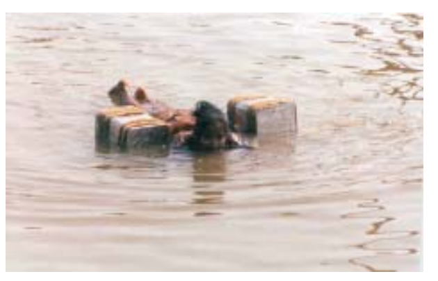
A Village Girl having Rescue Training

f. Specialized Training of DMTs: Each of the DMTs comprise groups of women and men volunteers and are assigned with a specific task to discharge. Specialized training is provided on search and rescue, first aid, trauma counselling and water & sanitation teams for skills up gradation. All DMTs are linked with existing govt. service providers for continuous training. Some of the training institutions have been strengthened for regular training of DMTs at various levels.