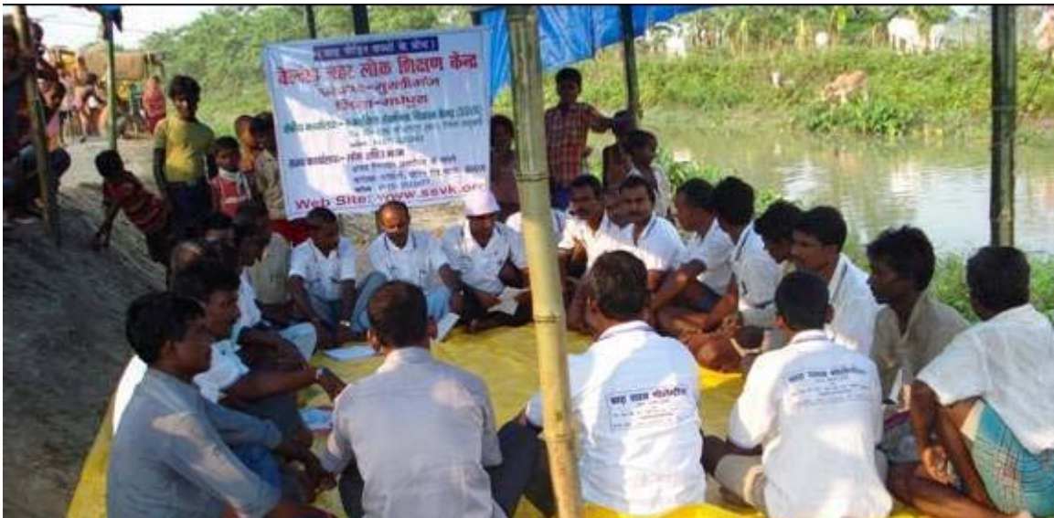
SSVK grassroots volunteers in a meeting in child care centre run by ssvk in murliganj district Madhepura

The systematic approach of serving these flood affected families thru identity slips and proper record maintenance led to support from like minded organizations like AIDMI (All India Disaster Mitigation Institute), UNICEF, Tulsi Trust and Bhojraj Charitable Trust . Our request to the DM Madhepura's office to support with electricity was also met with a positive response and generator